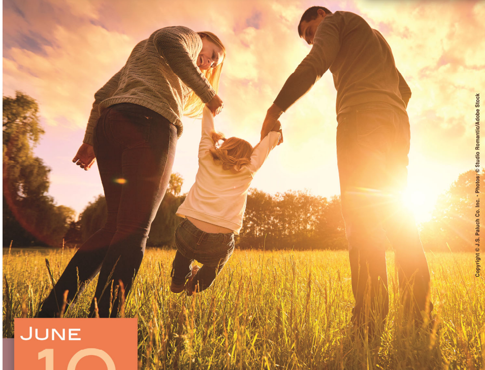
Copyright © J.S. Paluch Co. Inc.